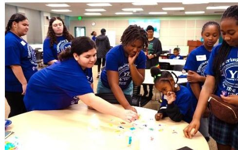
Students working on STEM activity.