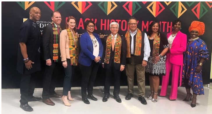
SCE Black History Program presenters

Congratulations to all the honorees! The event provided a wealth of valuable information, and we express our gratitude to SCE for extending the invitation, allowing us to connect and learn more about their commendable initiatives in our communities. As a result, we look forward to exploring Edison programs and services, including Edison Scholars, Line Worker Scholarship, and Free Energy Education classes, which we plan to introduce to Young Legends and the broader SGV-NCNW membership.