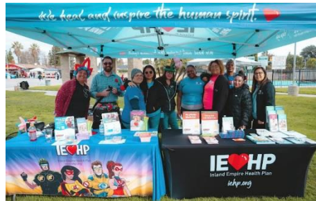
Inland Empire Health Plan