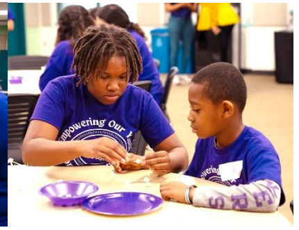
Working on STEM activity.