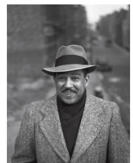
James Langston Hughes

Rapper, record producer, & entrepreneur. Known for his involvement in the success of other artists; named the greatest other rapper of all time by Billboard and Vibe in 2023.