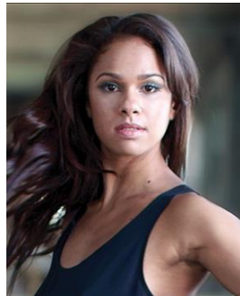
Misty Danielle Copeland

Dancer and choreographer; Artistic director emerita of Alvin Ailey American Dance Theater.