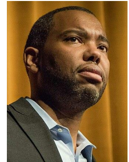
Ta-Nehisi Paul Coates

Film director, producer, screenwriter, actor, & author. His production company has produced more than 35 films since 1983.