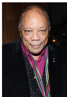
Quincy Delight Jones Jr.

Youngest U.S. inaugural poet in history; award-winning writer; cum laude graduate of Harvard University.