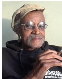
Melvin Van Peebles

Photographer, composer, author, poet, & film director; one of the first Black American filmmakers to direct films within the Hollywood system.