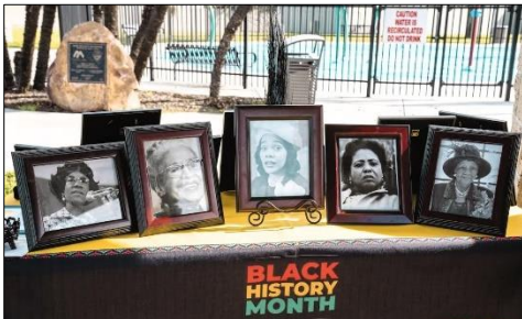
Black History Display Table

This event served as a wonderful way to celebrate Black History Month and showcased the power of community strength and unity. The success of this second annual celebration is a testament to the dedication and commitment of The Black Chamber of Commerce, the City of Montclair, the Christian Development Center, and all the contributors who played a pivotal role in making this event unforgettable.