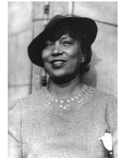
Zora Neale Hurston

Considered the first African American author of a published book of poetry.