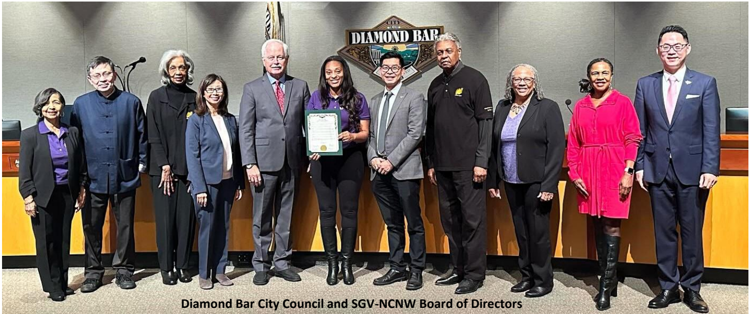
Diamond Bar City Council and SGV-NCNW Board of Directors

On Feb. 6, 2024, the Diamond Bar City Council officially proclaimed February 2024 as "Black History Month." It affirmed their unwavering commitment to upholding the principles of freedom, equity, justice, and access for all. During a City Council meeting on the same day, the Council presented SGV-NCNW with a proclamation, recognizing our contributions to the community and acknowledging the invaluable impact of Black Americans.