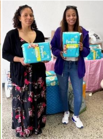
SGV-NCNW recently donated diapers, wipes, baby blankets, baby bibs, baby socks, onesies, and pacifiers to A Dyamond Touch.