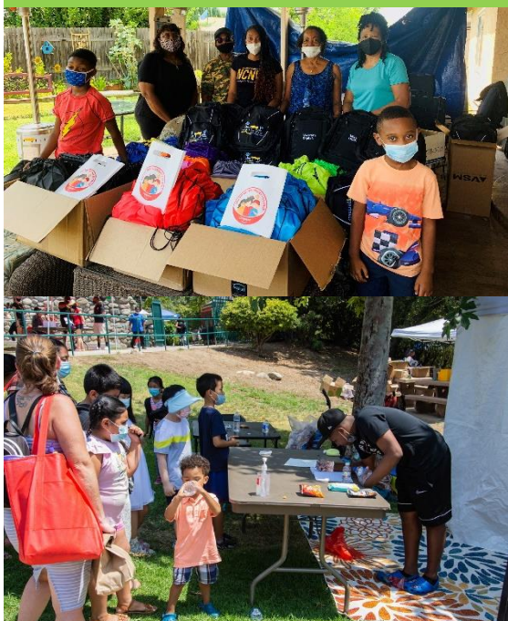
SGV members prepared 200+ backpacks